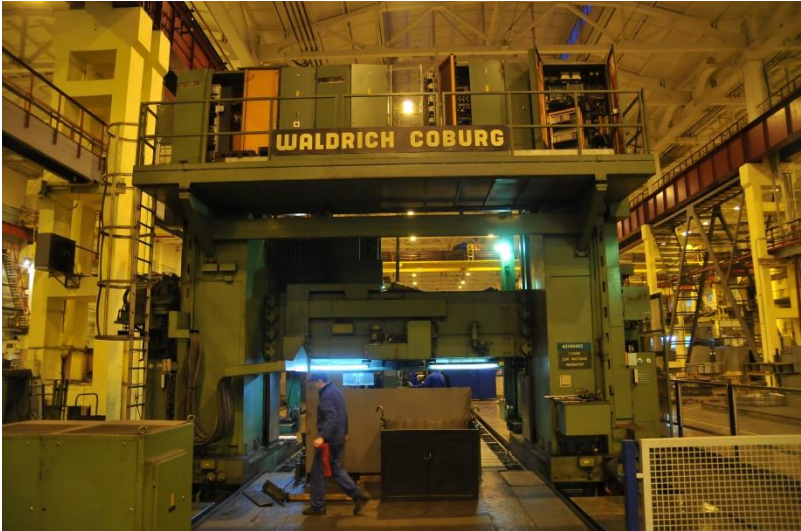
((04_Gantry-vorher.jpg)) Example of a 40+ year-old gantry milling machine before...