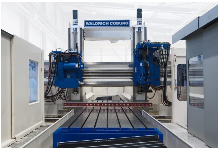
((07Schleifmaschine_nachher.jpg)) ...and after modernization.