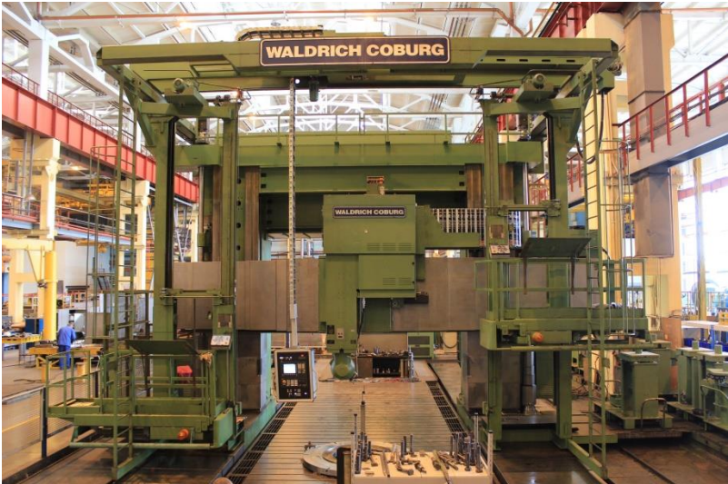
((05_Gantry_nachher.jpg)) ...and after modernization.