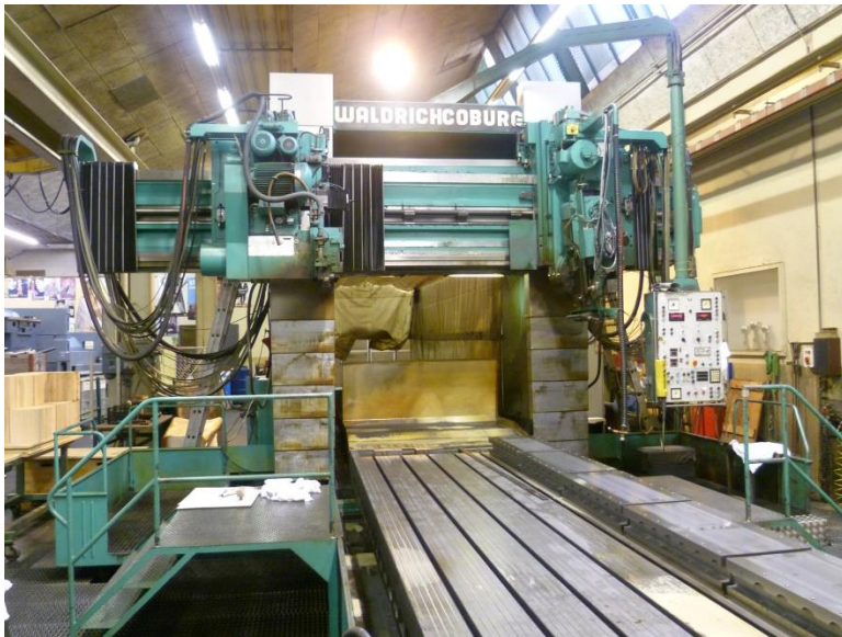
((06_Schleifmaschine_vorher.jpg)) Example of a 40+ year-old grinding machine before...