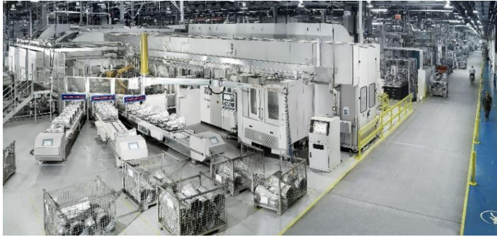
((2017_Heller4Industry_Manufacturing System 2.jpg))

Industry 4.0 under its own control: Maschinenfabrik Heller has been implementing the EMO 2017 motto "Connecting systems for intelligent production" with its own networked production lines for years.